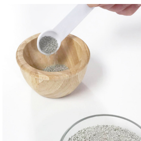
Measure Desired Amount

InstaMask™ granules are hard, but when water (or an aqueous booster) is added in a 1:1 ratio, the granules will hydrate and soften becoming a soft paste that can easily be applied on the face. The granules should hydrate for a minimum of 2 minutes before mixing.