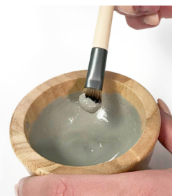
Ready to Apply