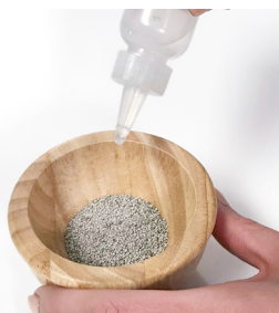
Add Water or Booster Formula